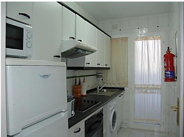
Fully fitted American kitchen