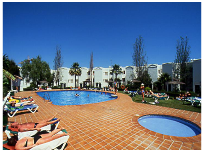
Pools and sundeck