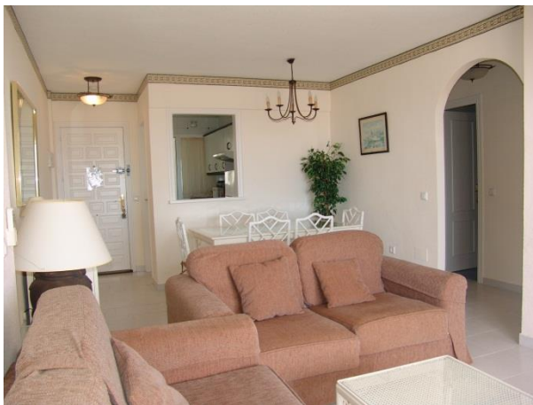
View from lounge to dining area